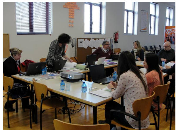
Second Partner Meeting, 3-4 April 2014, Burgos, Spain