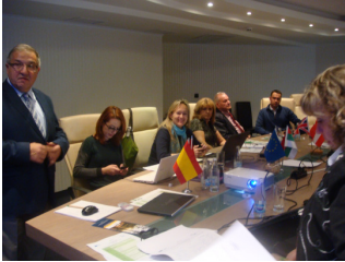
Kick-off Meeting, 13-16 November 2013, Ruse, Bulgaria